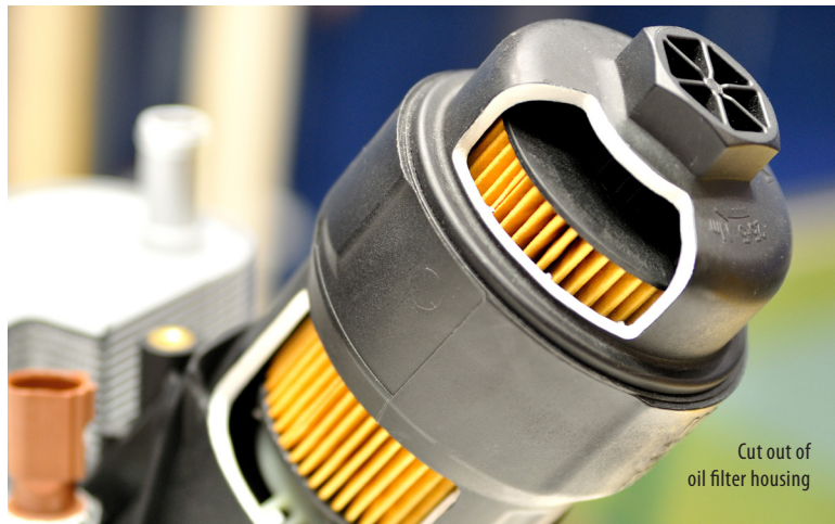
Cut out of oil filter housing